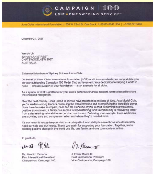
Letter from Chair & Vice Chair of Campaign 100

In passing, perhaps it is important to mention that in addition to their high profile fundraising activities, Sydney Chinese Lions have also accomplished a range of other Serving projects. They visited elderly nursing homes, organised a major tree planting project at Dundundra Falls Reserve, hosted their Humanitarian Scholarships and Teal Ribbon Scholarships, ran Health Seminars and Wealth Management Seminars for the public, hosted a successful and glamorous N5 District Convention in 2014 when one of their members was District Governor and won multiple international awards from LCI in relation to membership growth, club bulletin and club website.