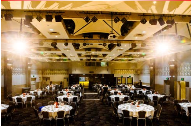
Tables inside the Lyceum set for Convention Dinner