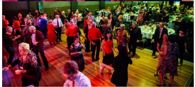
Guests having a good time on the Dance Floor