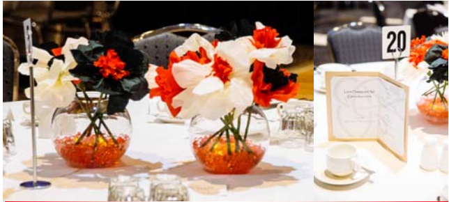
The Elegant Table Centre Pieces and Menu

No formal proceedings were arranged for the first hour. Guests mingled and chatted with