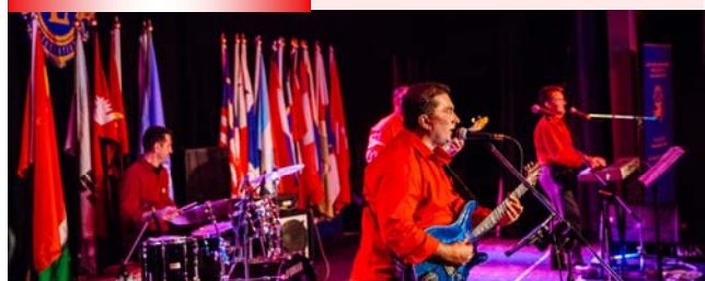
The Easy Riders