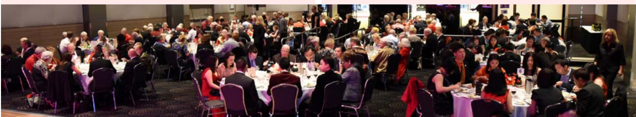
A Full House at the Convention Dinners