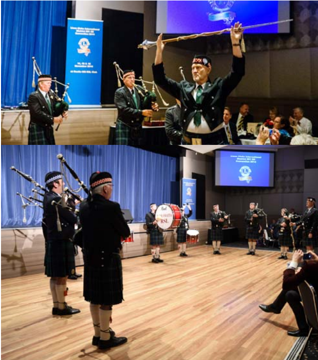
The Parramatta RSL Caledonian Pipe Band

Almost immediately afterwards, however, there was another drum roll coupled with the sound of bagpipes coming yet again from the rear door. Some were wondering if the band had made a swift come back and miraculously made its way to the rear door within seconds. When they turned their heads again, they saw yet another pipe band marching in. This was the 15 piece Castle Hill RSL Pipe Band! Clearly, when the guests realised that it was a second band, they were amazed and pleasantly surprised. Again, many cameras were working overtime!