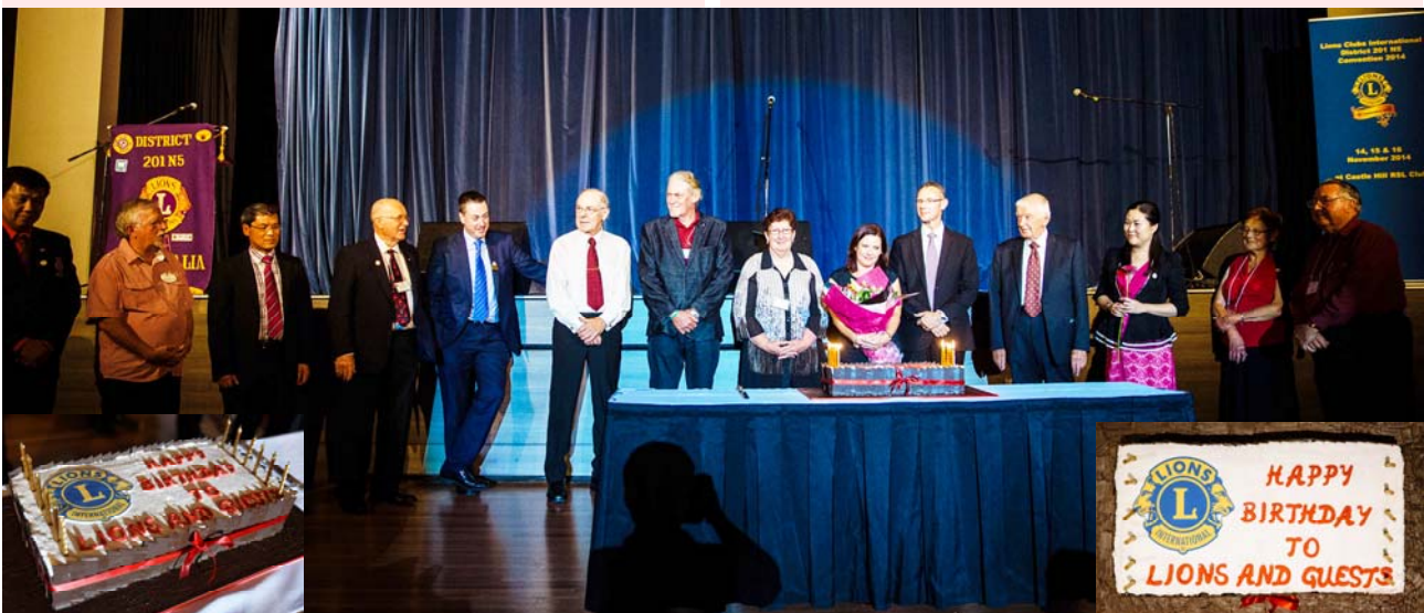
The Birthday Group and Candles Blowing

To realise the Lions' Code of Ethics "To be liberal with our praises", I prepared over 80 Certificates of Appreciation. Apart from the various individual contributors, there were three groups of individuals that I had to acknowledge and thank: the Sponsors, key help-