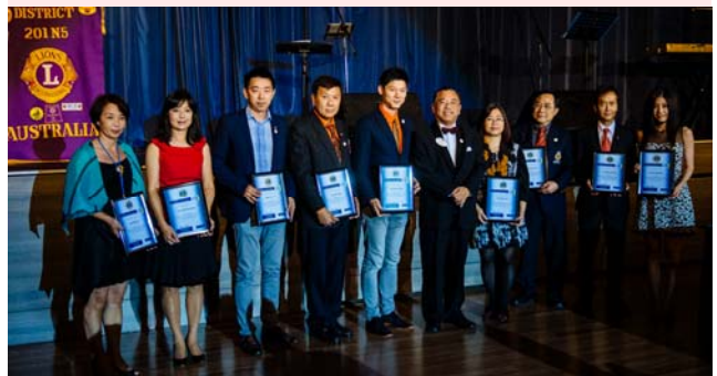
Key Helpers from Sydney Chinese Lions