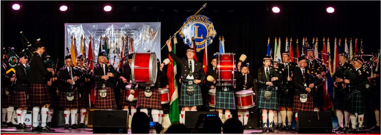
The Combined Pipe Band in their Full Grandeur and Majesty

This was the third treat that the guests had that evening, following the earlier separate performances of the two bands. It was simply delightful and amazing.