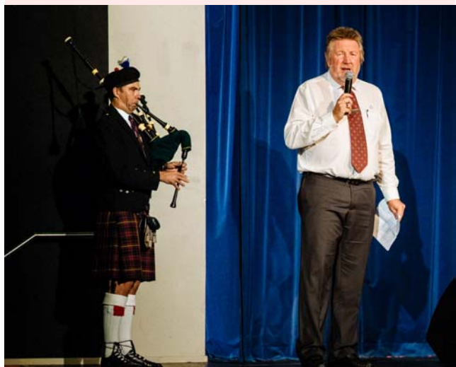
The Lone Piper