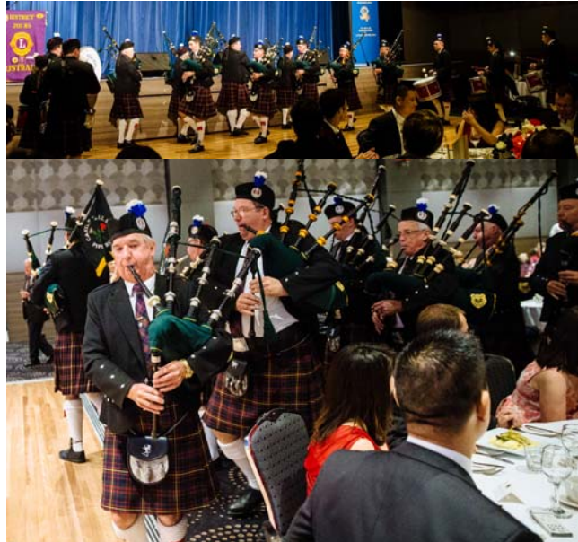
The Castle Hill RSL Pipe Band

The Castle Hill RSL Pipe Band put on another brilliant performance for a further 15 minutes.