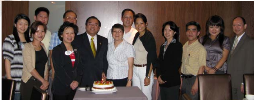
Sydney Chinese Lions & Guests at the January Members Meeting