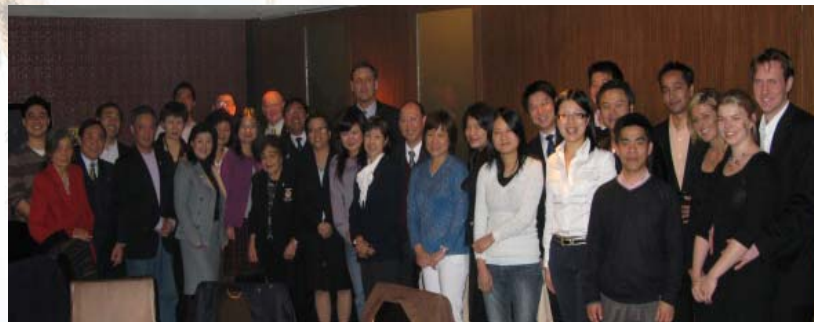
Members and Guests at May Members Meeting