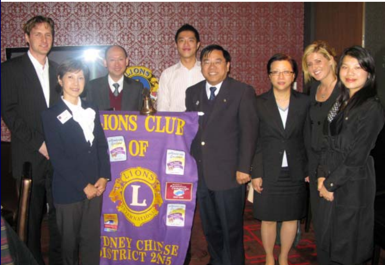
Scholarship Finalists with Adjudicating Panel at May Members Meeting

Their presentations were all very impressive, therefore in addition to the original award of one winner receiving a scholarship of $2,000, two consolation prizes of $1,000 each will also be awarded. The final results will be announced at the Club's Changeover Dinner on 4 June.