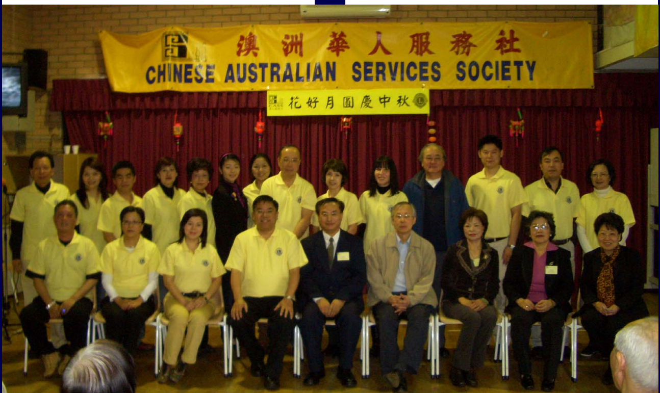
Sydney Chinese Lions with Senior Officials of CASS at their Campsie Headquarters