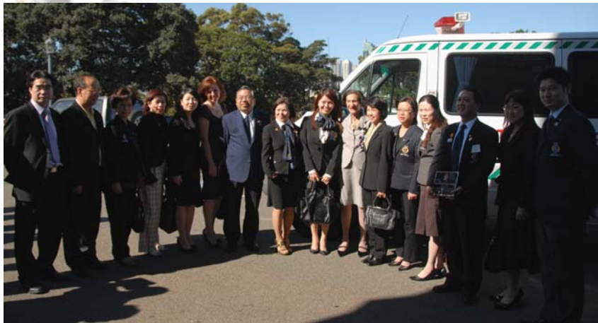
Sydney Chinese Lions at Handover Ceremony of Ambulance with Her Excellency Prof. Marie Bashir, Governor of NSW

invited to the Annual Awards Ceremony of St John Ambulance, during which, we were presented with a Special Plaque in recognition of our donation and support for them. Towards the end of the Ceremony, I had the honour and privilege to handover the keys of a brand new ambulance to St John which bears a plaque specifying the vehicle is donated by our Club.