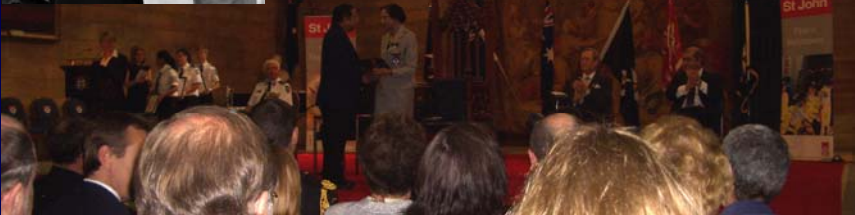
Sydney Chinese Lions Receiving a Special Plaque at the hands of Governor of NSW