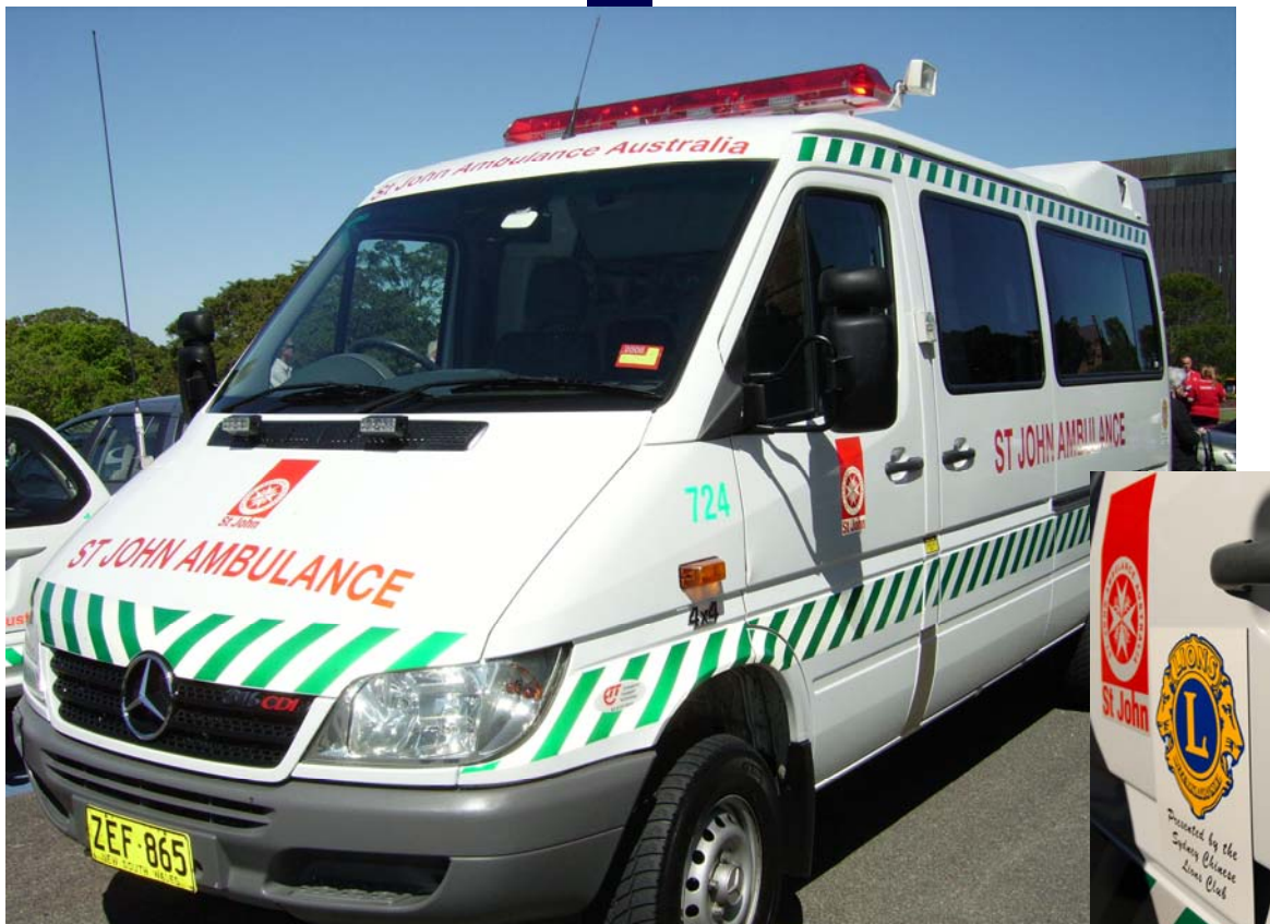
The Ambulance Donated to St John by Sydney Chinese Lions

The donation is to support St John Ambulance and its volunteer community programmes including its highly respected first aid services.