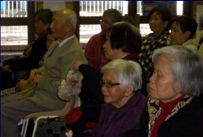
The Elderly at CASS