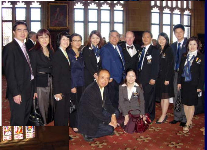
Sydney Chinese Lions at the Handover Ceremony