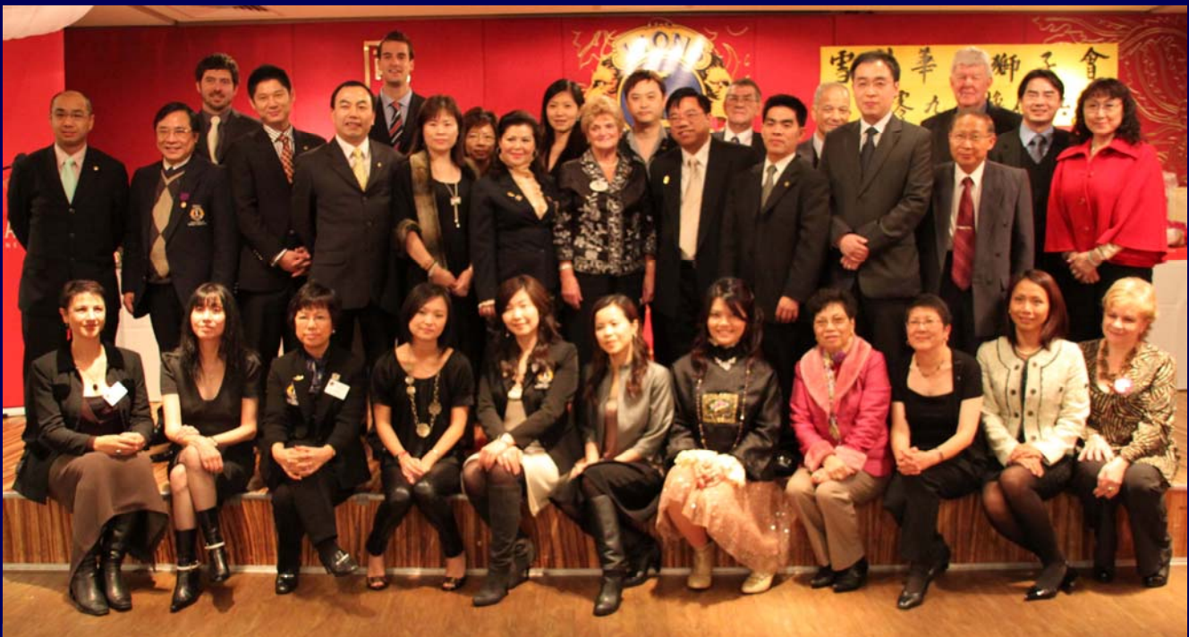
The 2009-10 Board of Directors with VIP Guests