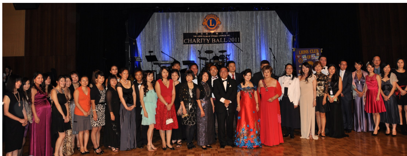
Sydney Chinese Lions at Charity Ball 2011