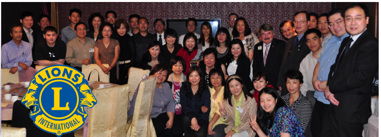
Sydney Chinese Lions and Guests at March 2011 Members Meeting