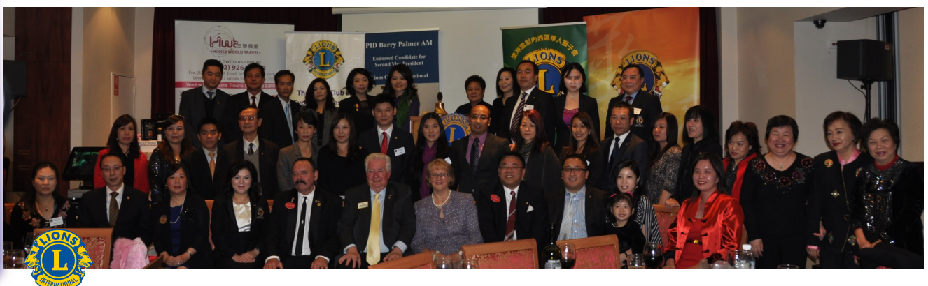
Sydney Chinese Lions and Guests at Fundraising Dinner on 14 May