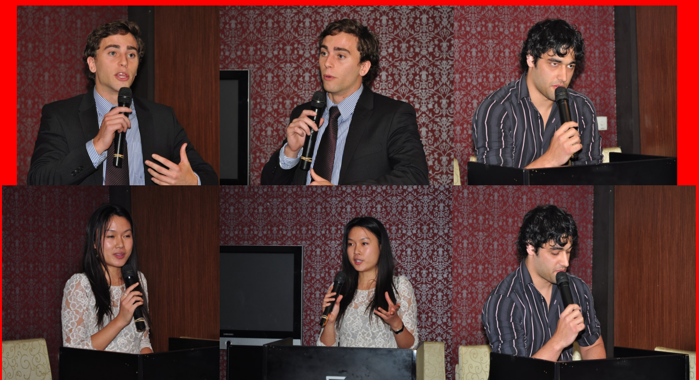
The 3 Humanitarian Scholarship Finalists at the May Members Meeting