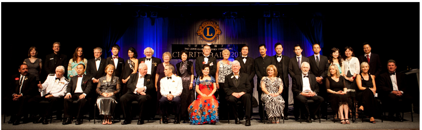
Sydney Chinese Lions at Charity Ball 2011