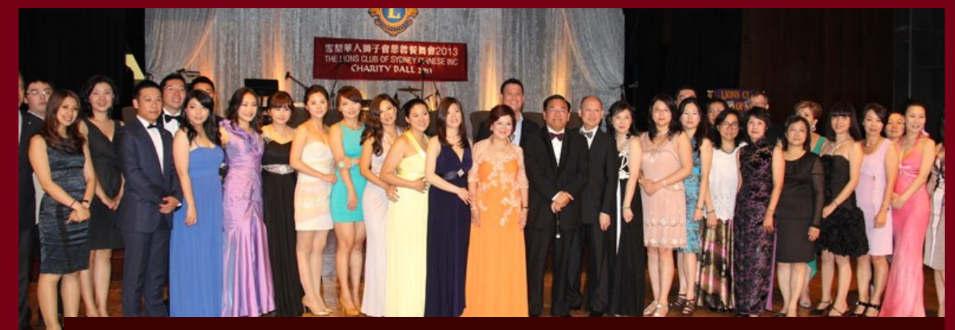
Sydney Chinese Lions at Charity Ball 2013

All members of the club and the Charity Ball 2013 Organising Committee are to be commended for their dedication and hard work.