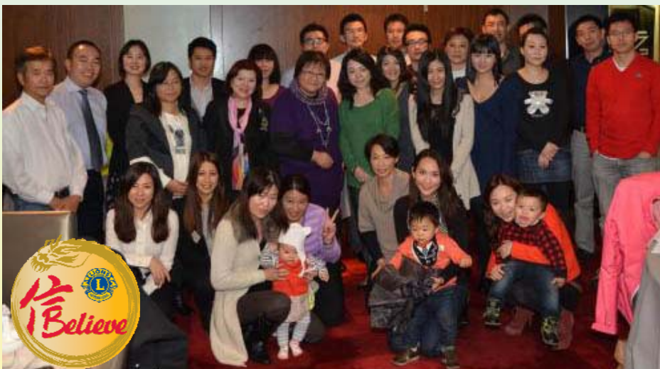
Sydney Chinese Lions and Guests at June Members Meeting