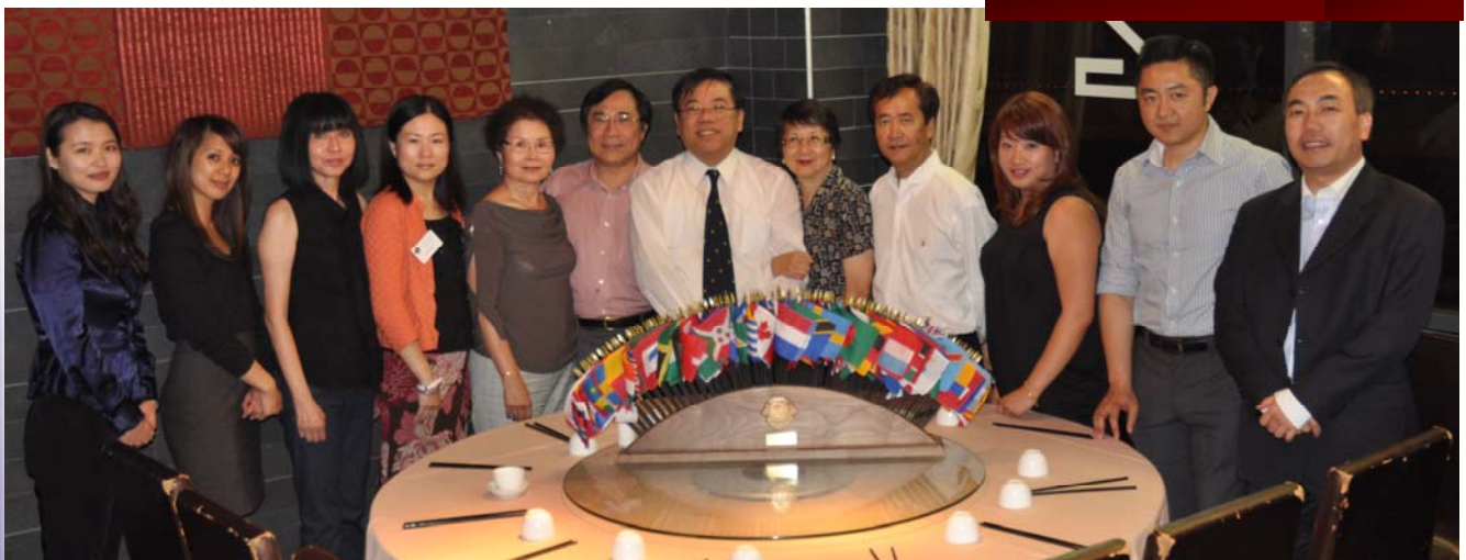
Sydney Chinese Lions and Guests at January 2011 Members Meeting