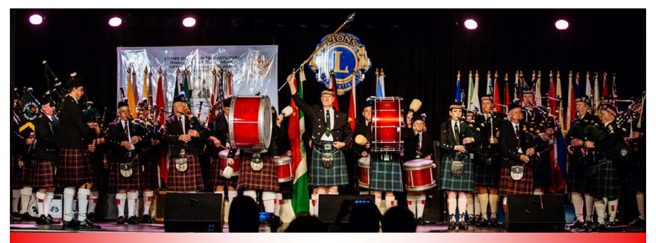
The Combined Pipe Band in their Full Grandeur and Majesty

This was the third treat that the guests had that evening, following the earlier separate performances of the two bands. It was simply delightful and amazing.