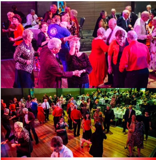
Guests having a good time on the Dance Floor

The generous sponsorships we attained also allowed us to have enough funds to produce a DVD pack comprising two DVDs. One comprises selected video clips of the Convention