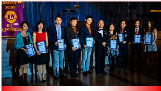
Key Helpers from Sydney Chinese Lions