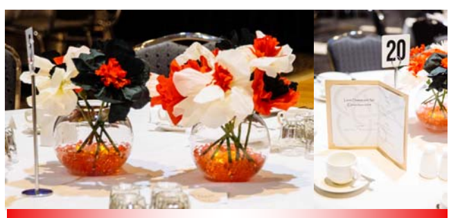
The Elegant Table Centre Pieces and Menu

No formal proceedings were arranged for the first hour. Guests mingled and chatted with