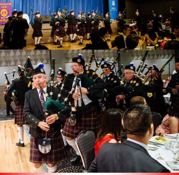
The Castle Hill RSL Pipe Band

The Castle Hill RSL Pipe Band put on another brilliant performance for a further 15 minutes.