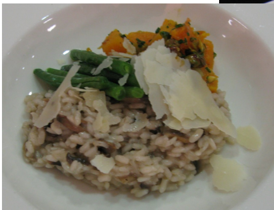
main course - the vegetarian alternative