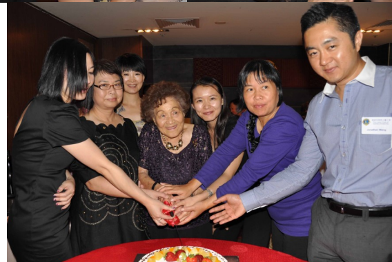
The Birthday Group