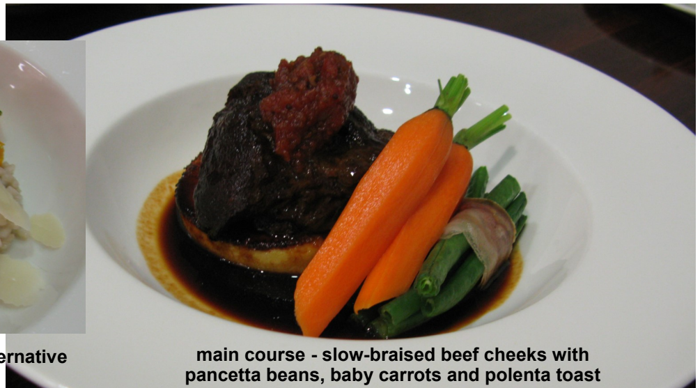
main course - slow-braised beef cheeks with pancetta beans, baby carrots and polenta toast

Feel free to ask your waiter/waitress for a vegetarian alternative if you so wish... Let's all have a ball at the Ball!