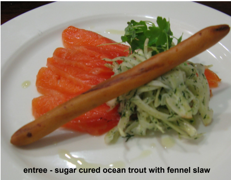
entree - sugar cured ocean trout with fennel slaw