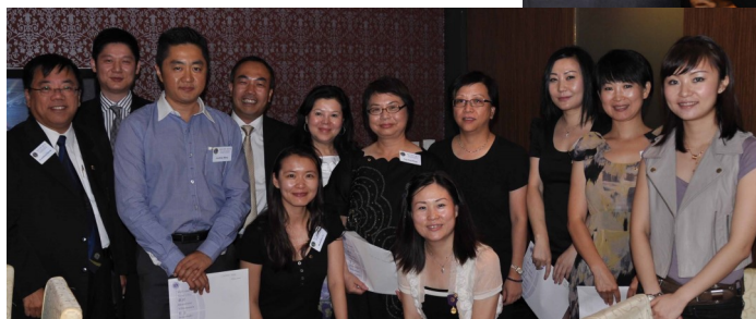
Newly Inducted Members and their Sponsors