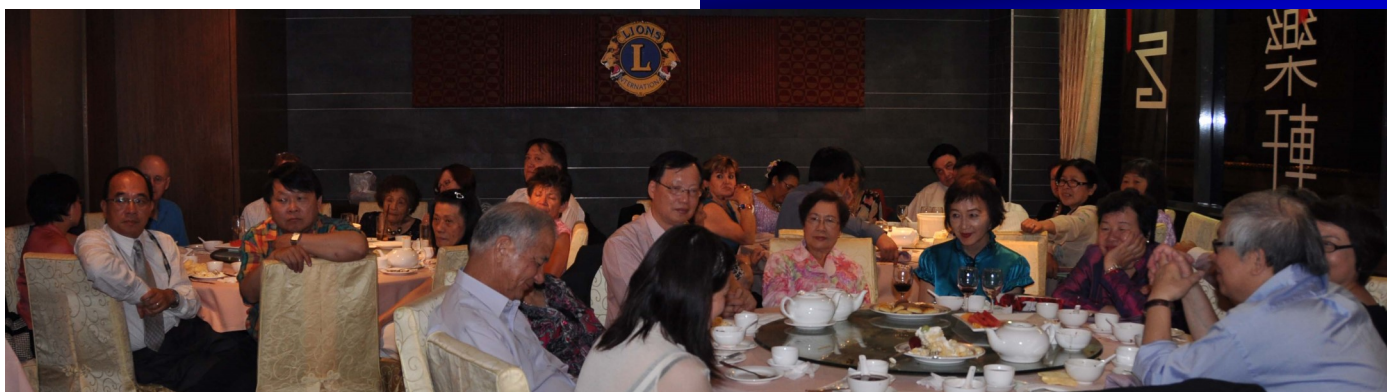
Sydney Chinese Lions and Guests at February Members Meeting