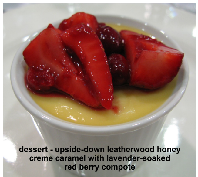
dessert - upside-down leatherwood honey creme caramel with lavender-soaked red berry compote

Feel free to ask your waiter/waitress for a vegetarian alternative if you so wish... Let's all have a ball at the Ball!