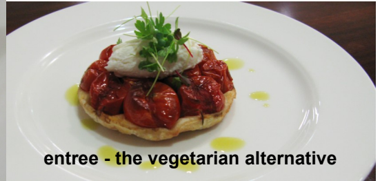
entree - the vegetarian alternative