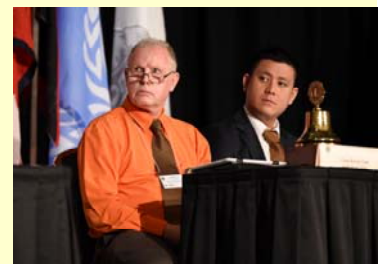
The Time-keeper & The Convention Chair

Morning tea was up next. Danish pastries were served alongside tea and coffee. Apparently, many were hungry then. Despite the fact that we had ordered 20 extra servings on top of the registered numbers, I was told there wasn't enough to share. There were some Lions at the back of the queue who didn't get to have any Danish pastries at all. I offer my sympathies to those who missed out and let me welcome them to my world. I actually missed out on both the morning tea and the Friday evening canapés as I had to use the break times for last minute preparations!