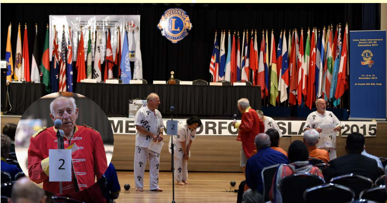
Inviting Lions "to Do Time" on Norfolk Island in September 2015