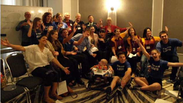
Participants at the Leo Forum

drinks was made available to them on a complimentary basis.