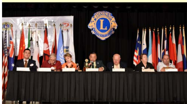
The Presiding Panel

NM2: That the Convention approves the Nurses Scholarship Foundation Limited (The Company which is the Trustee of the Nurses Scholarship Foundation Trust Fund) replacing its present Constitution (Memorandum and Ar-