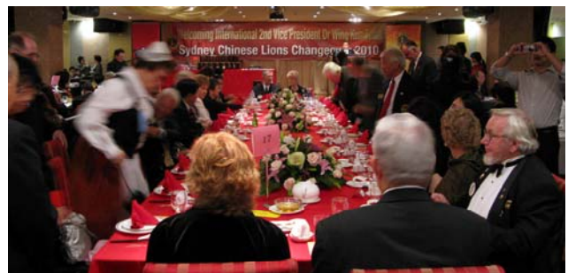
Guests at the VIP Table