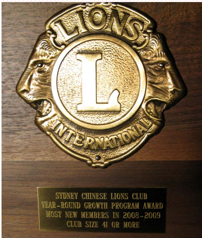
Lions Eblem and Plaque on the Wooden Base

This is the second time in the club's 15 years' history that they have received this award. In the 2005-6 Lions Year, they received an identical award for topping Constitutional Area VII in membership growth that year. Since 2004, Sydney Chinese Lions have seen net membership growth every year.