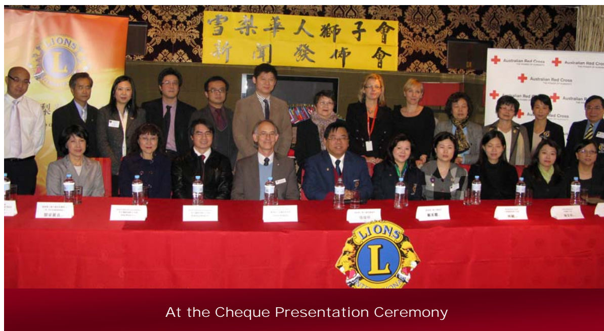
At the Cheque Presentation Ceremony