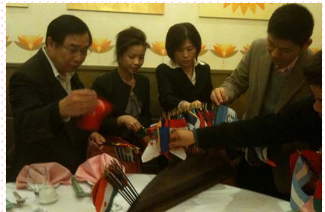
Sydney Chinese Lions inserting Flags onto the Wooden Base

The Club was the top club in Year-Round Membership Growth in the 2008-2009 Lions Year (the 41+ members category) in Constitutional Area VII which comprises all Lions Clubs in Australia, New Zealand, Indonesia and the South Pacific Islands.