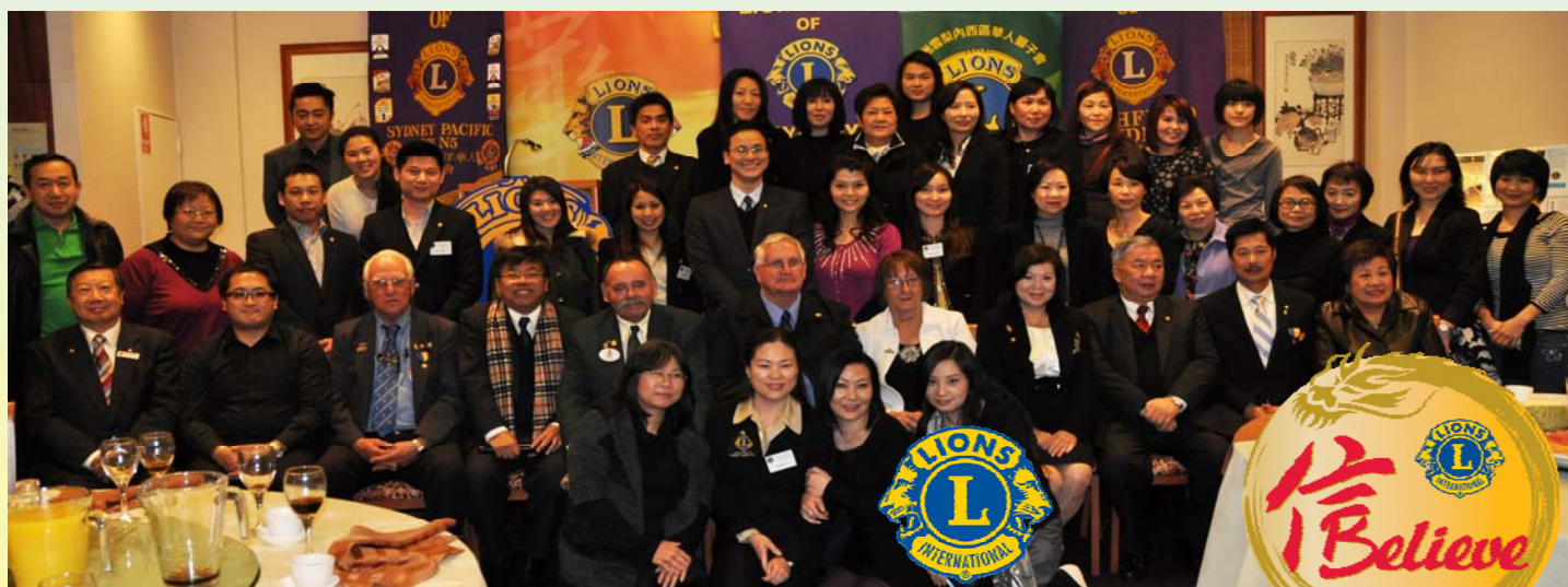
Sydney Chinese Lions and Guests at Zone 4 Meeting