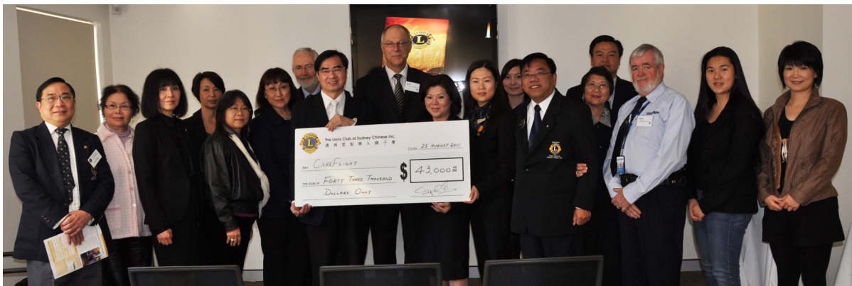
At the Cheque Presentation Ceremony

The $43,000 donation on this occasion comprises the major portion of net proceeds of the Sydney Chinese Lions Charity Ball 2011