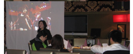
at the Sydney Chinese Lions September 2011 Information Night