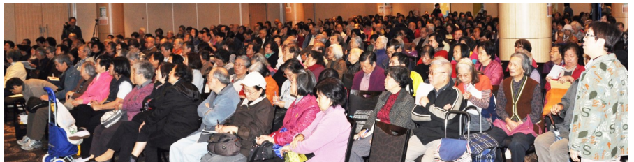
Attendees at the Health Talk

this very meaningful service every year. At this stage, they are already exploring possibilities of holding a 2-day back to back talks next year for the 2 major dialect groups of the Australian Chinese community, with Cantonese presentations featured on one day and