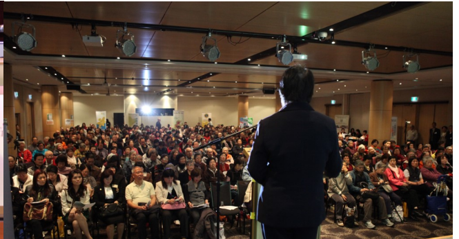
Inside the Packed Lecture Theatre

Chinese Medicine Association (Chinese Medicine), and The Chinese Medicine and Acupuncture Society of Australia (Chinese Medicine).