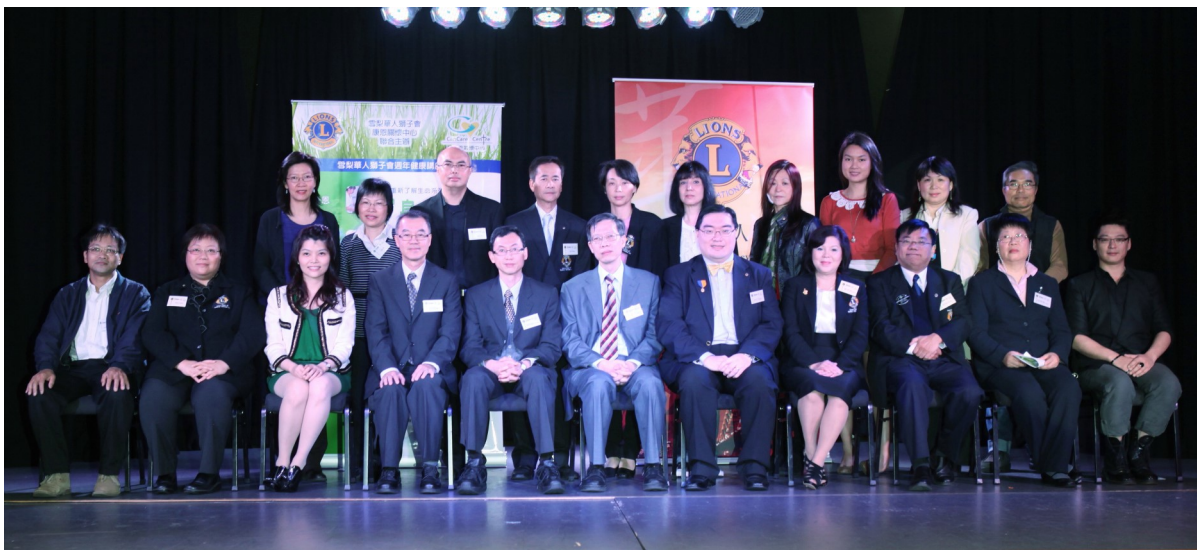
At the Official Opening Ceremony of the Sydney Chinese Lions Health Talk 2011

Similar to last year, this year's function was supported by three major Australian professional medical organizations (both Western and Chinese medicines) including The Australian Chinese Medical Association (Western Medicine), The Australian Traditional