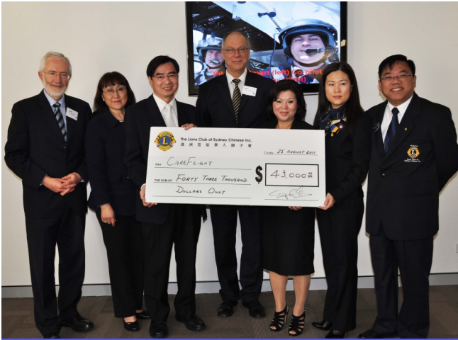
At the Cheque Presentation Ceremony with Major Sponsors