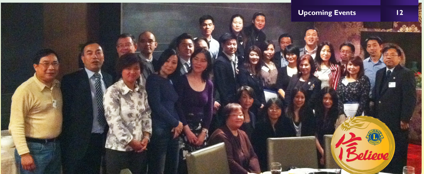
Sydney Chinese Lions and Guests at September Members Meeting