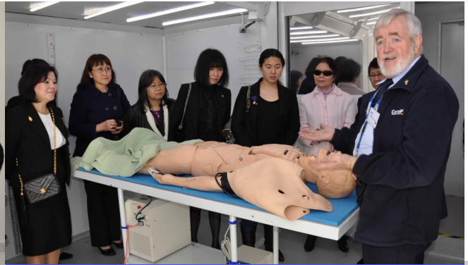
Visiting CareFlight's Training Simulator