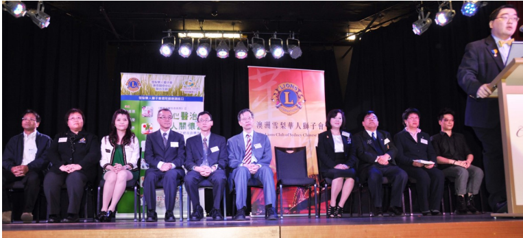
At the Official Opening Ceremony