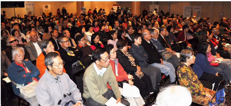
Attendees at the Health Talk

Putonghua presentations featured on another.