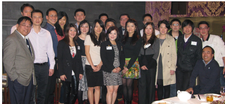
Sydney Chinese Lions and Guests at September 2011 Information Night