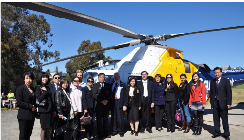
Sydney Chinese Lions and Guests with CareFlight's Life Saving Helicopter

Those who wish to find out more about the work and service provided by Sydney Chinese Lions are welcome to access their award winning website at www.sydneychineselions.org.au .