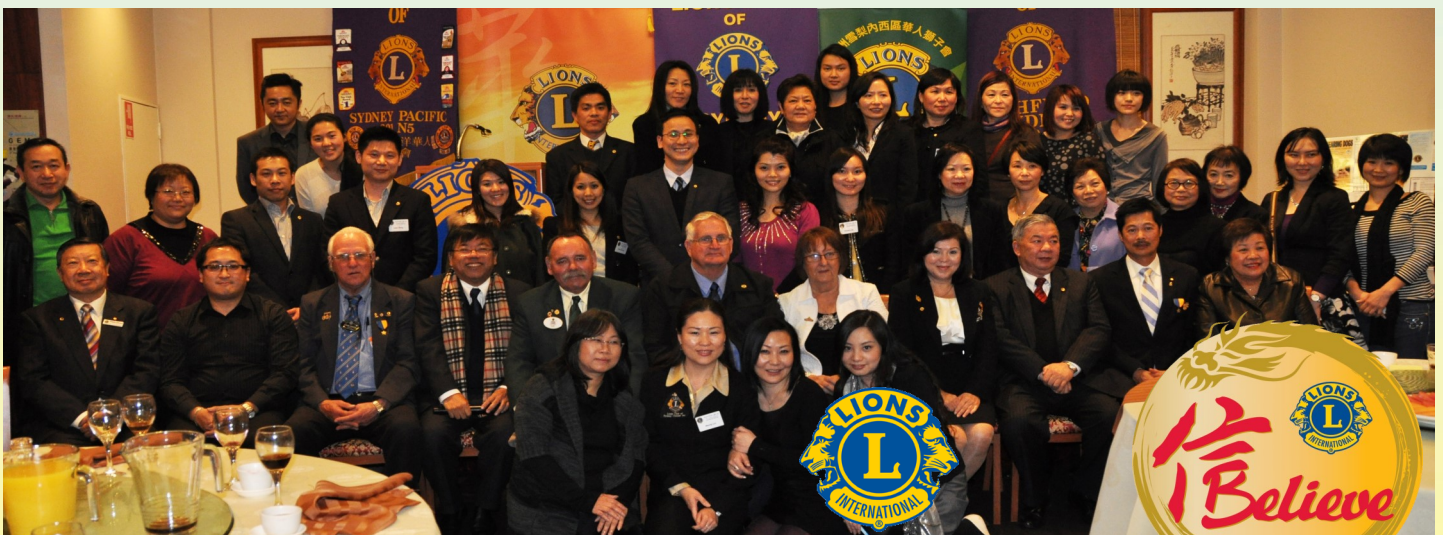
Sydney Chinese Lions and Guests at Zone 4 Meeting