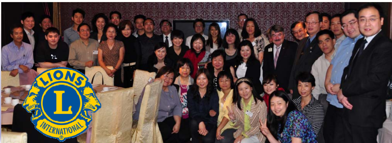
Sydney Chinese Lions and Guests at March 2011 Members Meeting