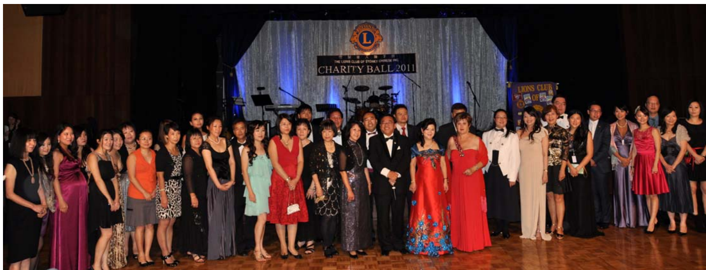
Sydney Chinese Lions at Charity Ball 2011