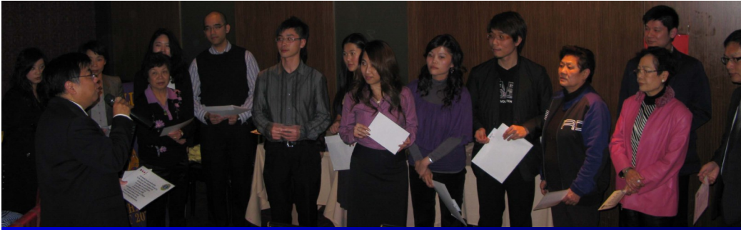
New Members Induction