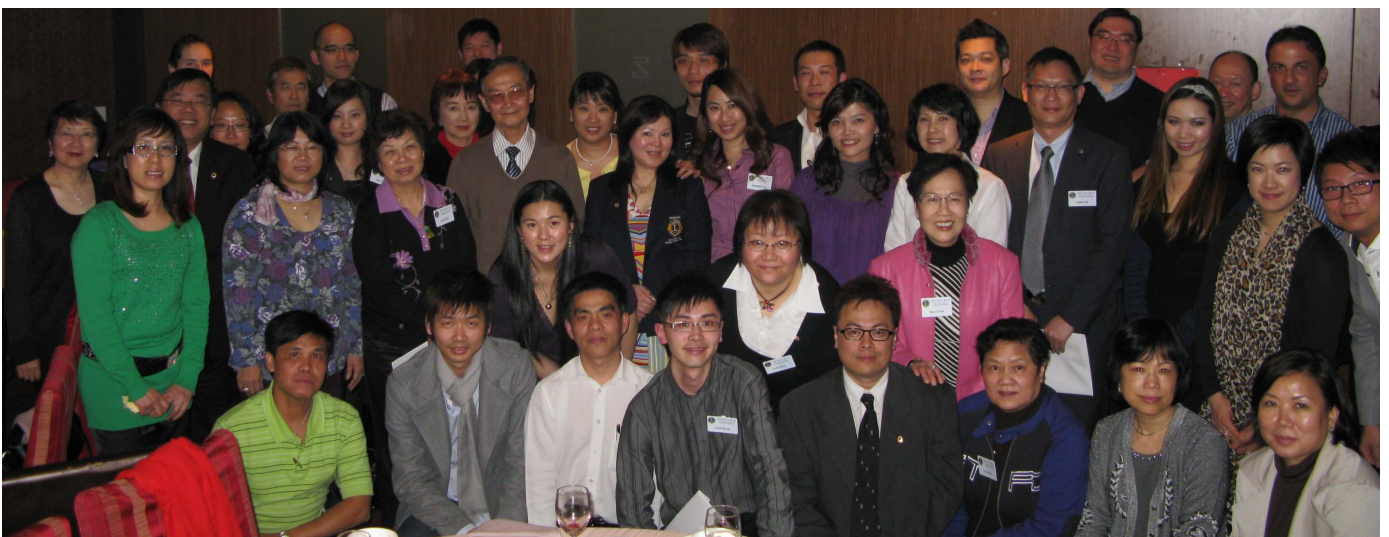
Sydney Chinese Lions and Guests at September Members Meeting

一年一度的雪梨華人獅子會健康講座將於十月三十日，星期六舉行。而下一次第五分域會議將會於十一月一日，星期一於皇冠酒家舉行。