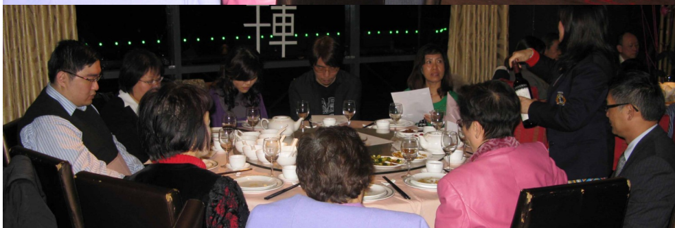
Sydney Chinese Lions and Guests at September Members Meeting