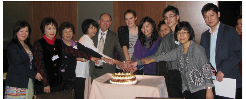
Birthday Cake Cutting