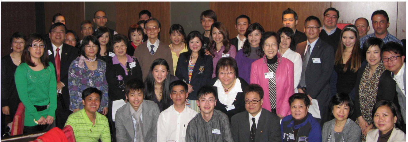
Sydney Chinese Lions and Guests at September 2010 Members Meeting