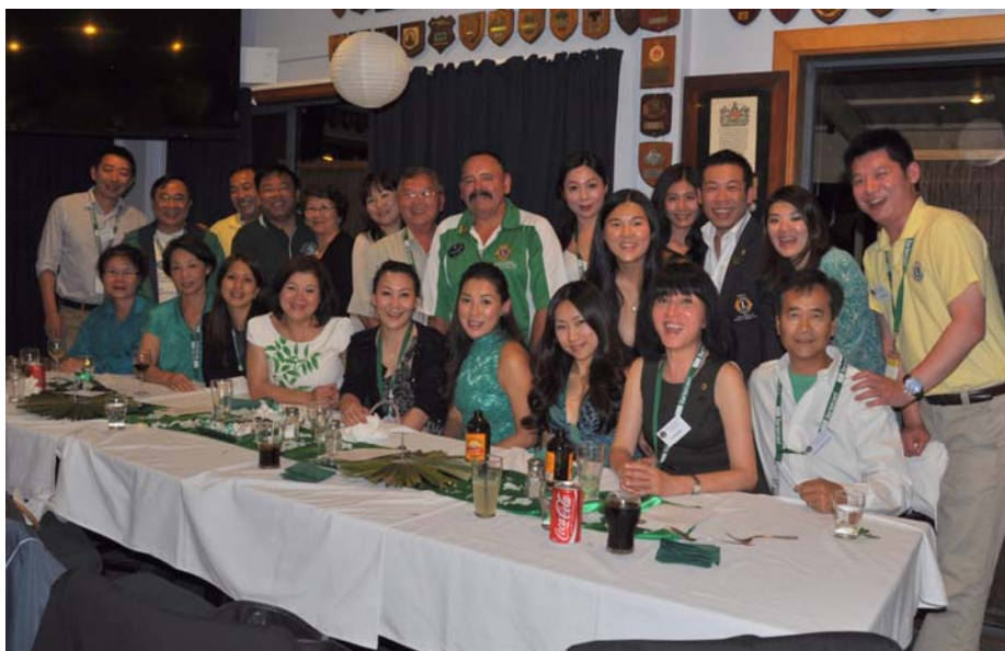
Sydney Chinese Lions and Guests at Convention Dinner

The host clubs provided everyone at the Convention with a fantastic hospitality programme. We all enjoyed immensely the Garden Party at the Government House and the Social Night at the RSL Club. All in all, the Convention was so wonderful that we are already looking forward to attending the coming District Convention in Lithgow in November 2012.