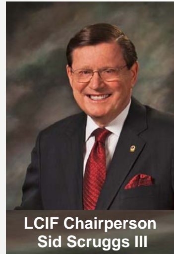
LCIF Chairperson Sid Scruggs III

Are you interested in starting Lions Quest but don't know where to begin? There are several new materials to assist in beginning or expanding the Lions Quest program. A how-to brochure provides a step-by-step guide through the process. Lions Quest: A Global Success is a new video that provides positive examples of the program around the world. A Community Partnership Grant program was created to assist Lions districts and multiple districts in beginning or reactivating Lions Quest programs. A limited number of grants are available for up to US$10,000.