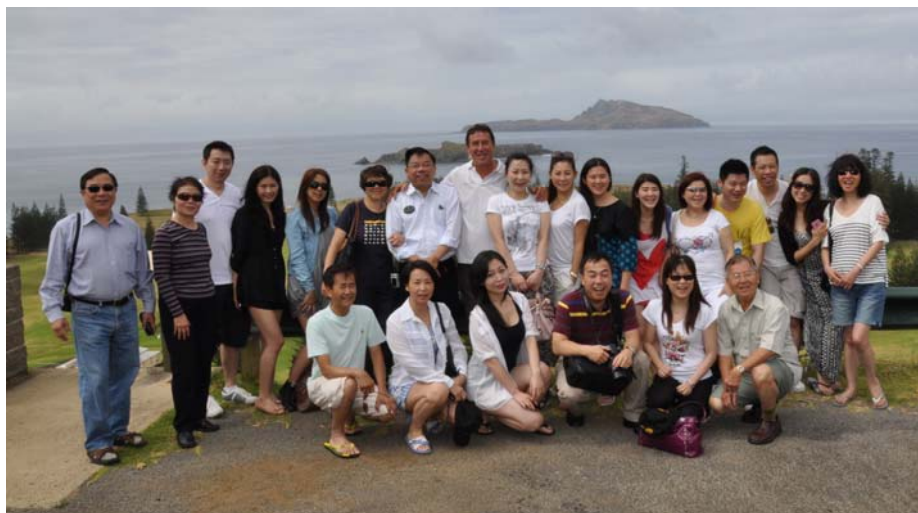
Sydney Chinese Lions and Guests at Queen Elizabeth Lookout on Norfolk

At the Convention, the General Meeting of Lions Nurses Scholarship Foundation was duly convened. A new member was inducted into the Norfolk