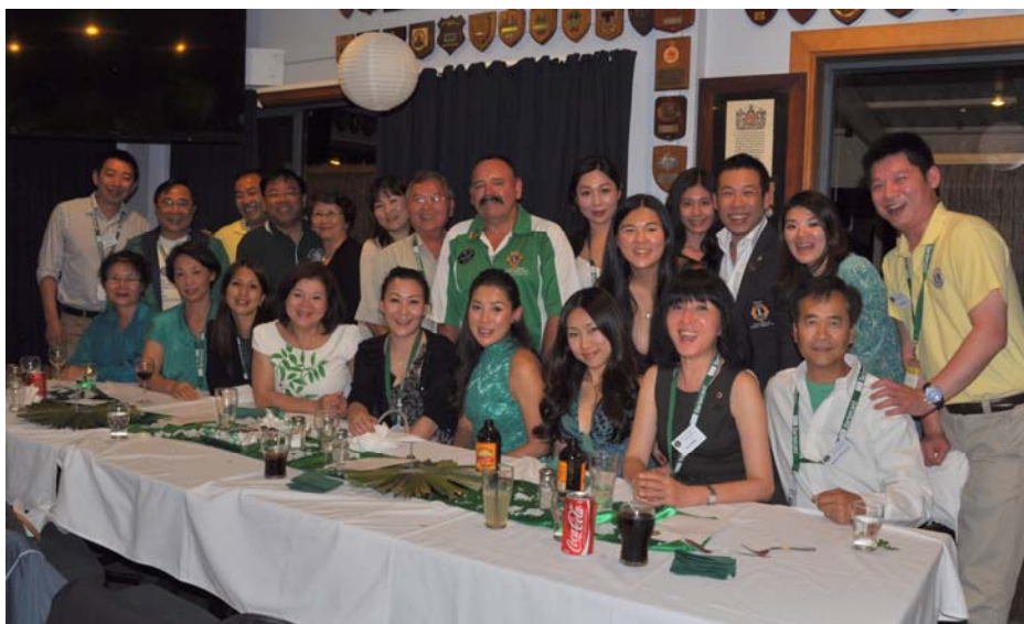
雪梨華人獅子會一眾會員及代表出席諾福克島 201N5 區年度大會