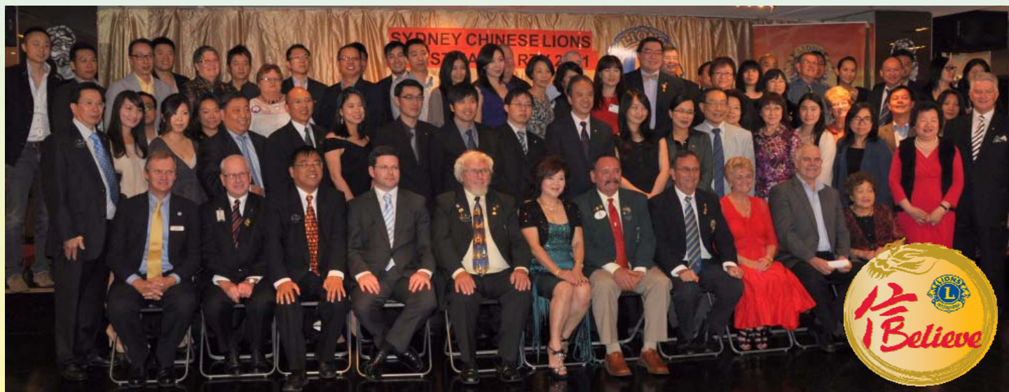
Members and Guests at Christmas Party 2011