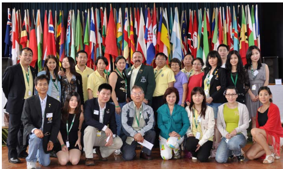
Sydney Chinese Lions and Guests at Norfolk Convention