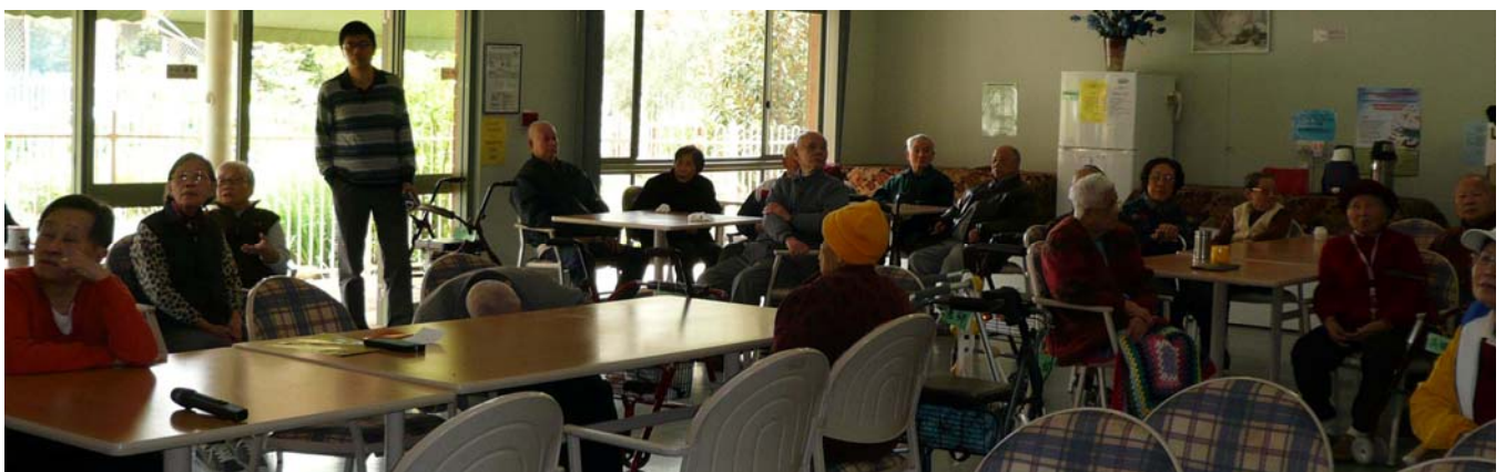
Some of the Elderly at the Indo-Chinese Elderly Hostel

For more informational about the Lions Club of Sydney Chinese please visit the Club's website at: www.sydneychineselions.org.au .