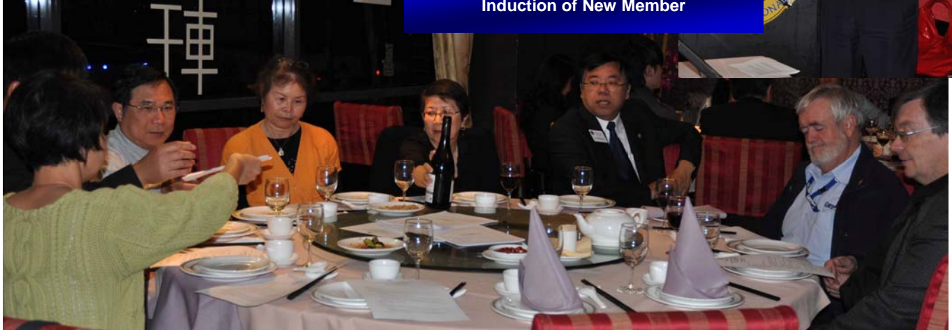
Sydney Chinese Lions and Guests at November Members Meeting