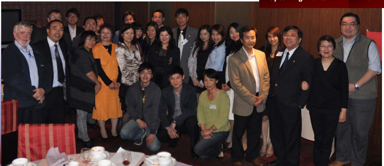
Sydney Chinese Lions and Guests at November 2010 Members Meeting