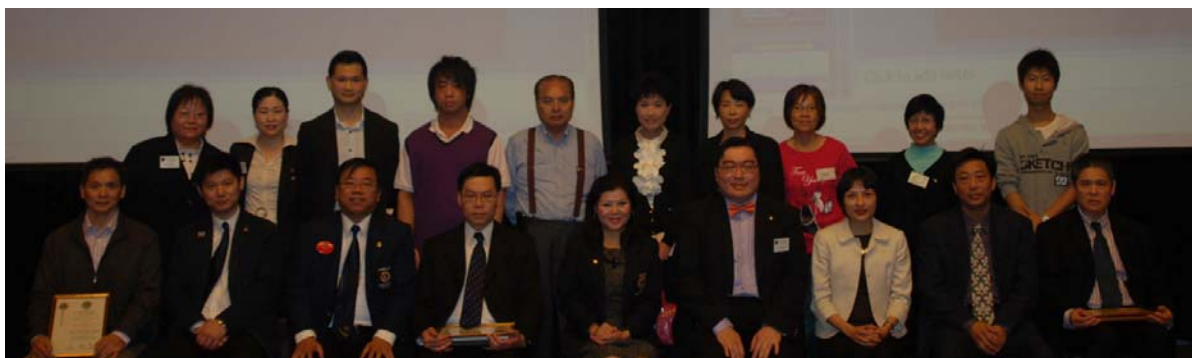
At the Opening Ceremony