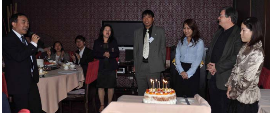
The Birthday Group