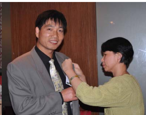
Induction of New Member