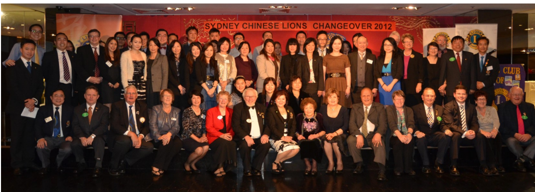
Sydney Chinese Lions and Guests at Changeover 2012