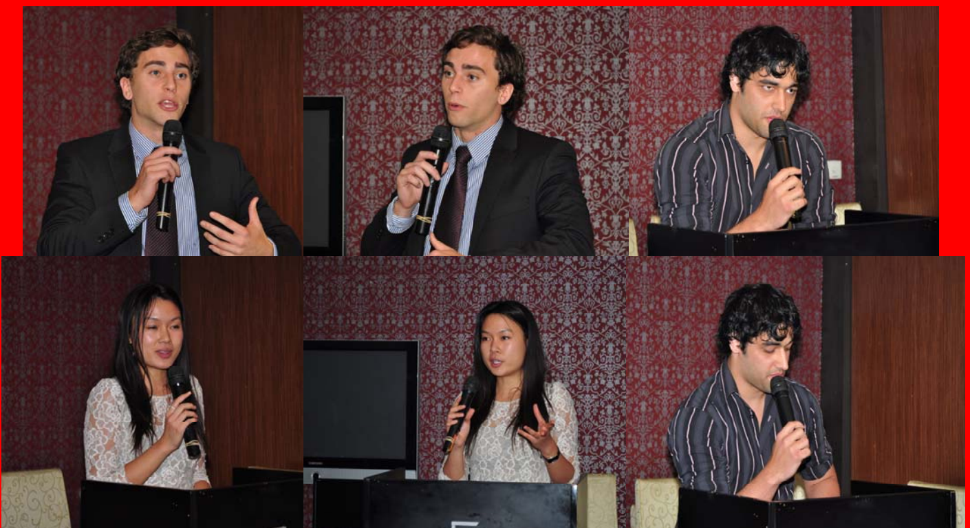
The 3 Humanitarian Scholarship Finalists at the May Members Meeting