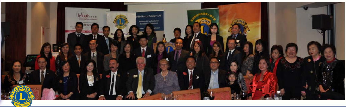
Sydney Chinese Lions and Guests at Fundraising Dinner on 14 May