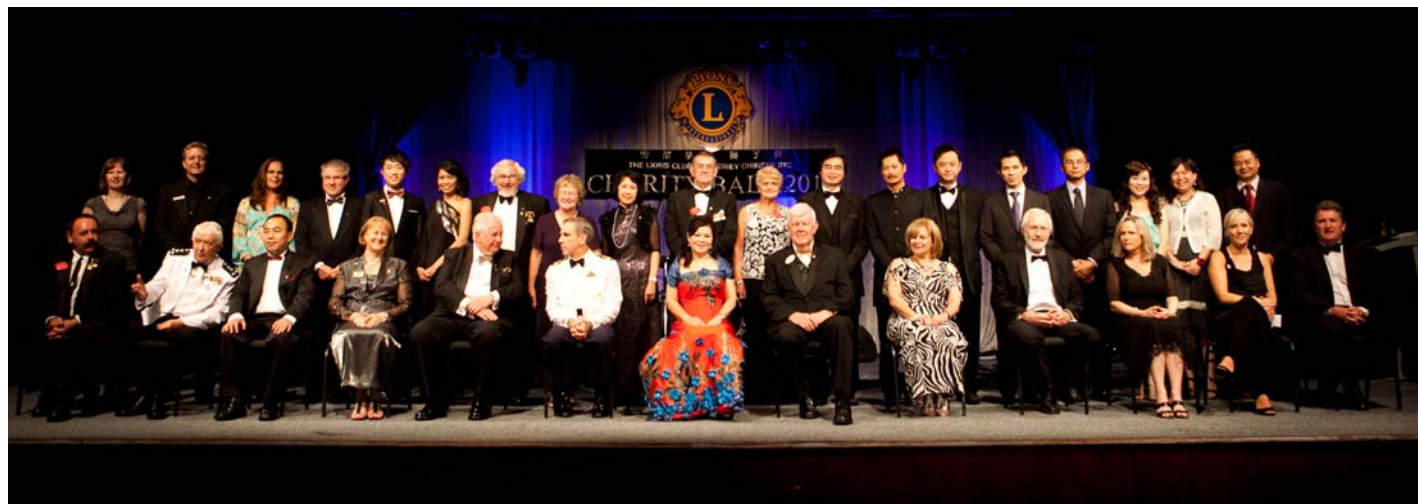
Sydney Chinese Lions at Charity Ball 2011