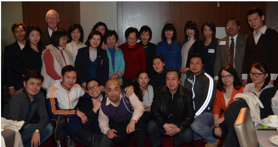
Sydney Chinese Lions and Guests at August 2012 Members Meeting