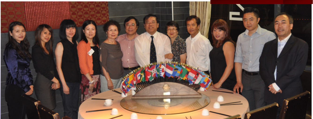
Sydney Chinese Lions and Guests at January 2011 Members Meeting